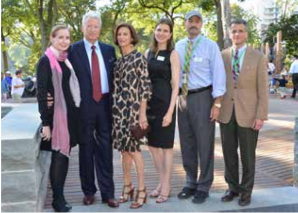
East 110th Street Playground Dedication