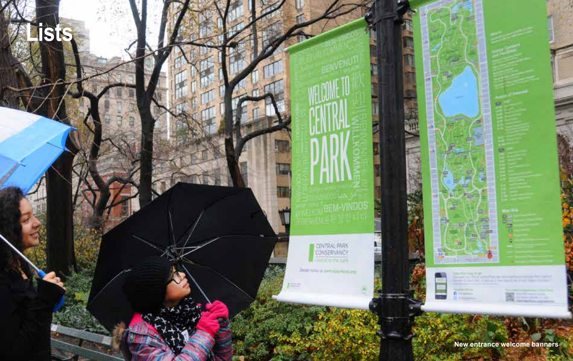
New entrance welcome banners