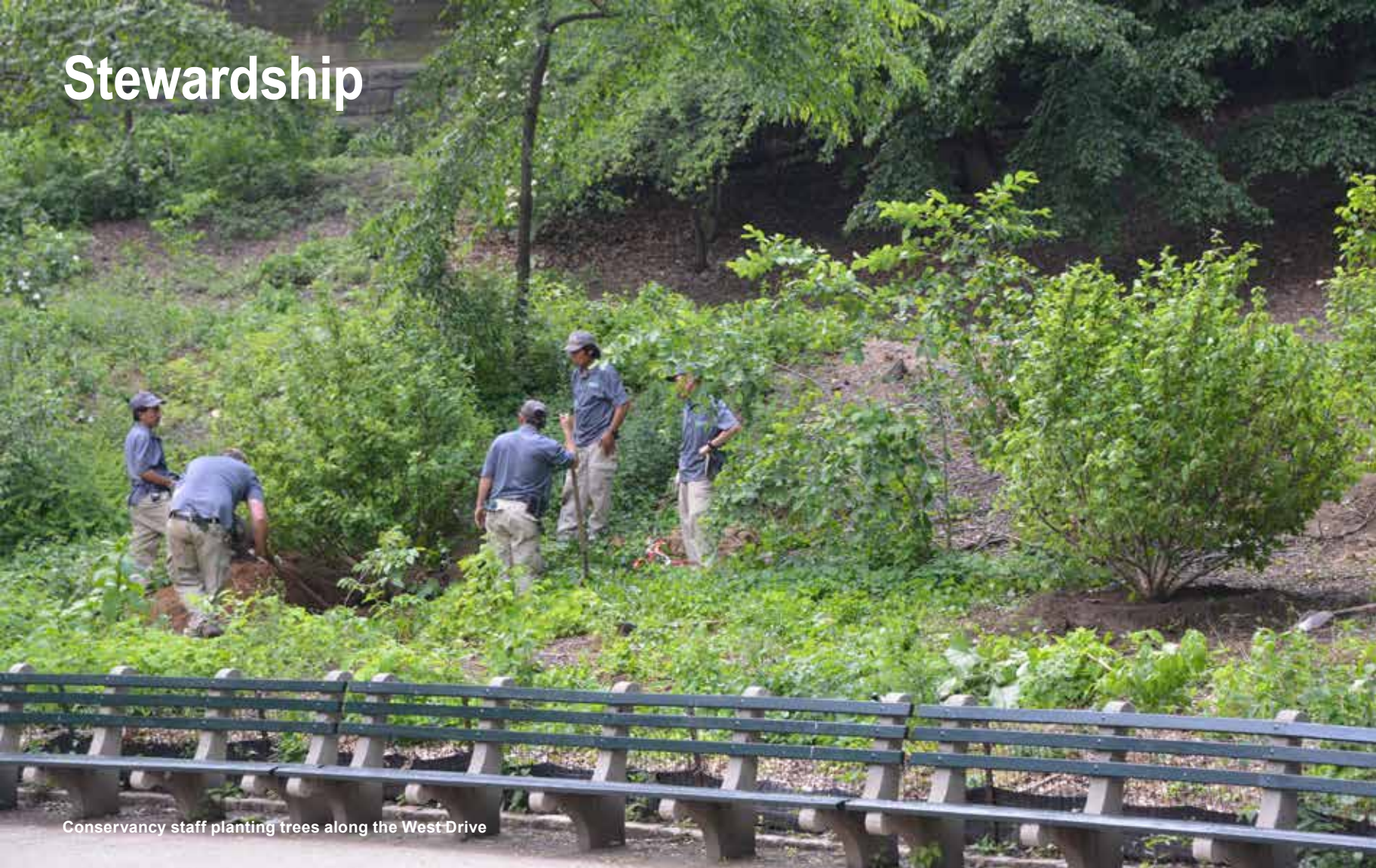
Conservancy staff planting trees along the West Drive