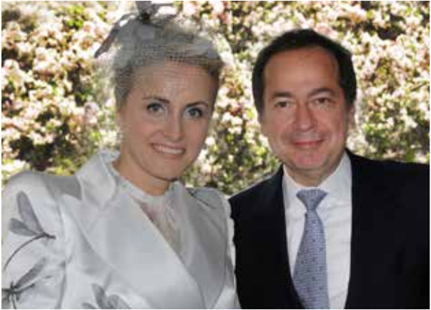
Frederick Law Olmsted Honorees, Jenny and John Paulson