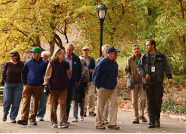
Fall Foliage Tour