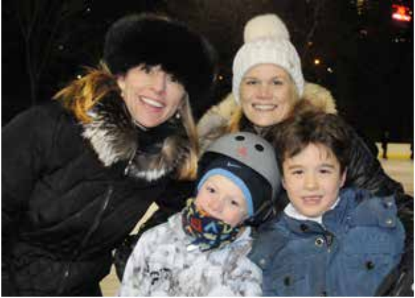
Annual Skating Party