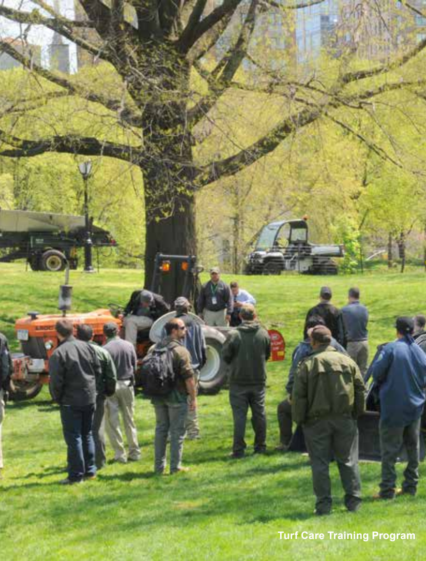
Turf Care Training Program

This year the Conservancy has also made a commitment to training by hiring an Assistant Director of Staff Training and Development to ensure that all Central Park Conservancy staff are given the opportunity to enhance their professional skills and grow within the organization. In 2013 we have also re-launched our excellent horticulture training program for our Conservancy staff and volunteers.