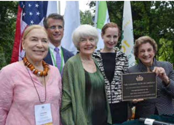
Garden Club of America East 69th Street Entrance Dedication