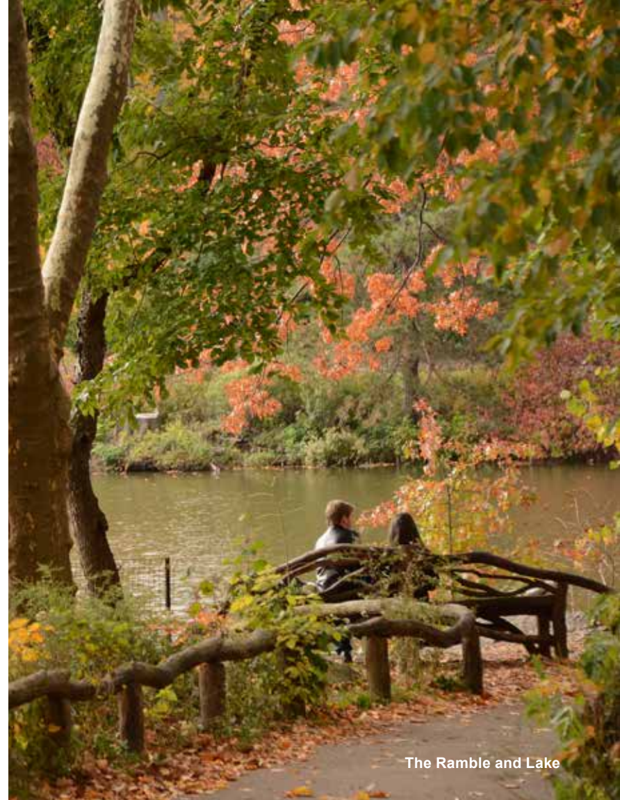
The Ramble and Lake

A cornerstone of the Institute's work to support other parks is the Park-to-Park program, which offers both training and direct assistance to other park organizations. Included in our pedagogical model is both classroom and field training. We provide this and other training to current and aspiring professionals from urban park management and other related fields. All training modules are based on the Conservancy's best practices in operations and management, which have been developed and refined over the past three decades. The Conservancy has informally supported other park groups in a variety of ways over the years. The Park-to-Park Program of the Institute will help to develop a more focused and strategic approach to this work.