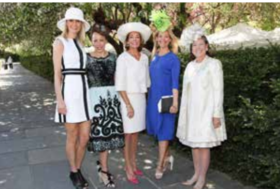
Frederick Law Olmsted Luncheon, sponsored by Tiffany & Co.