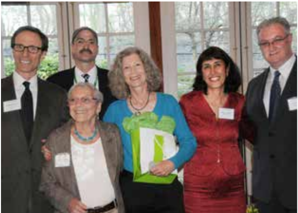
Volunteer Recognition Awards