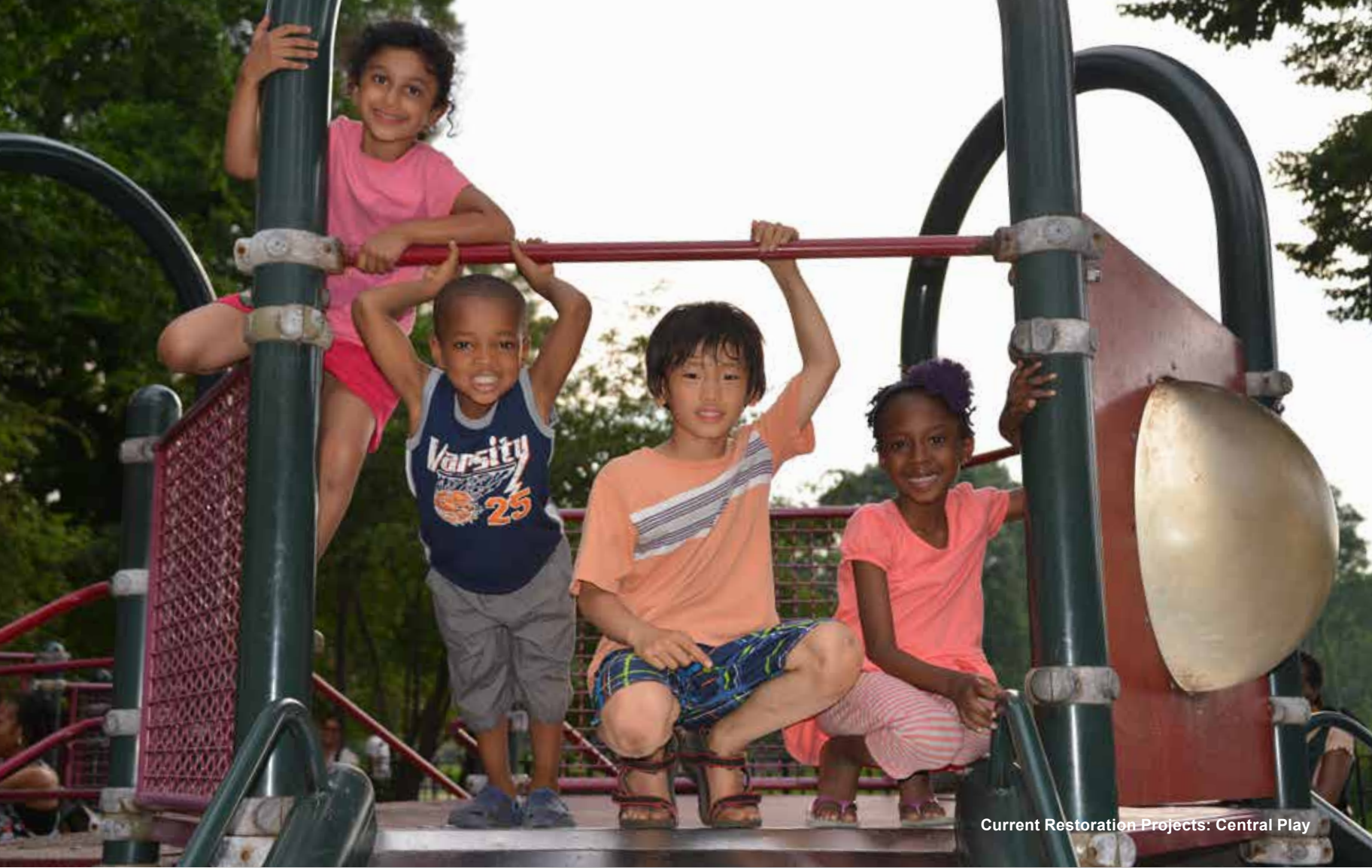
Current Restoration Projects: Central Play