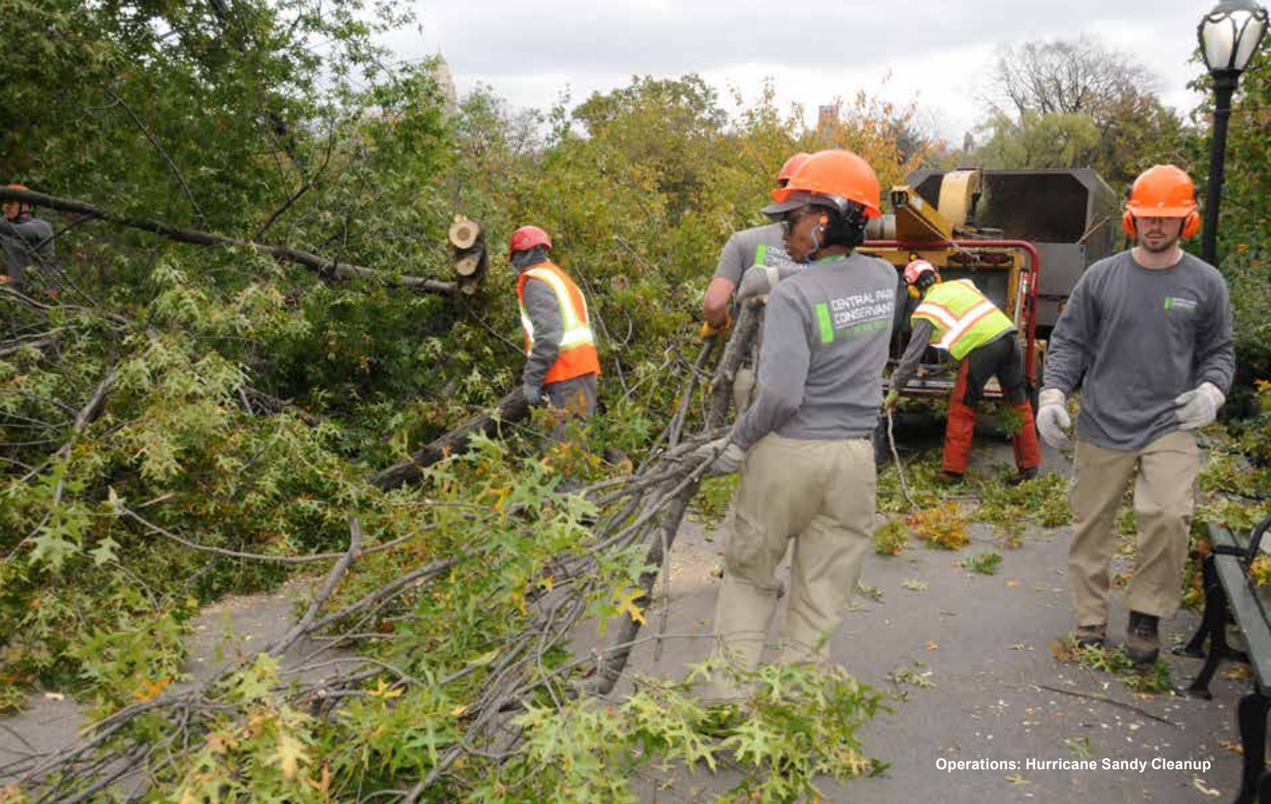
Operations: Hurricane Sandy Cleanup