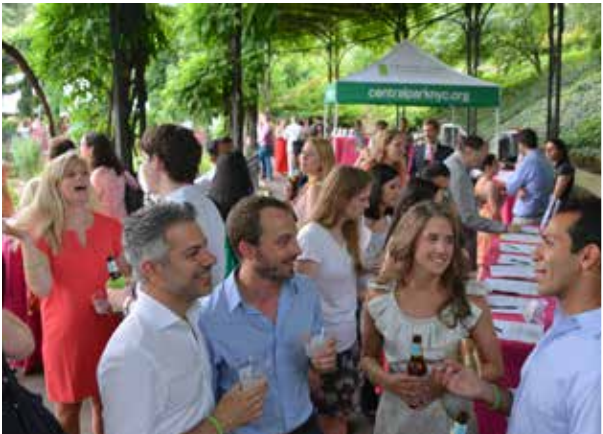
Evening in the Garden