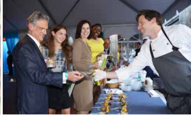
Taste of Summer, sponsored by Macquarie Group