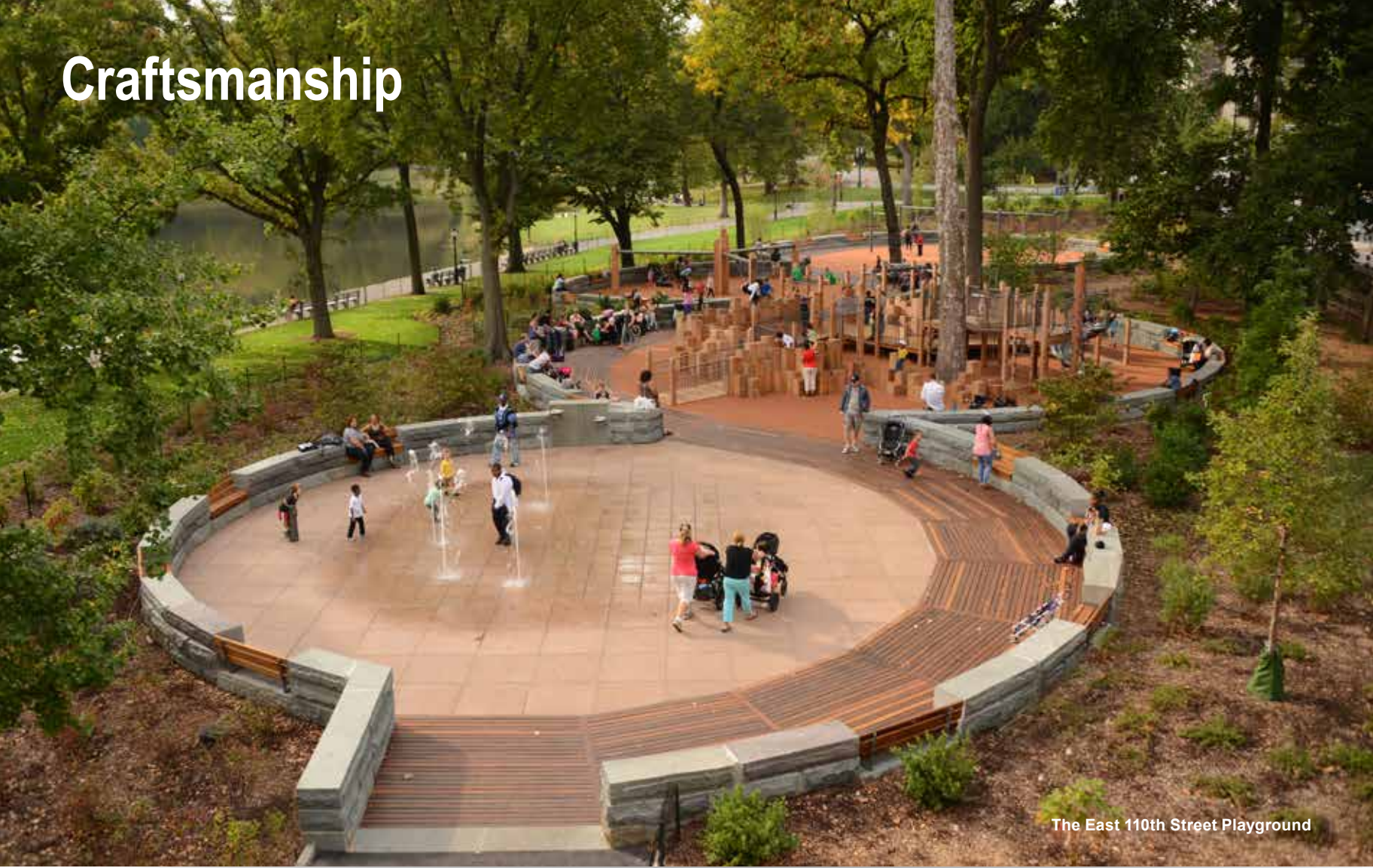
The East 110th Street Playground