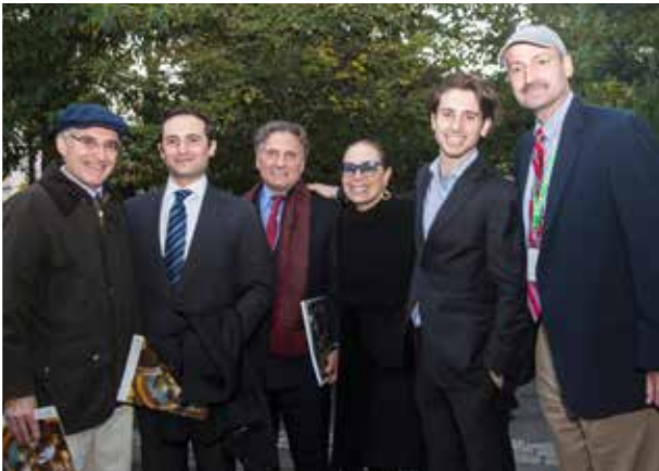
The Heckscher Foundation for Children celebrating Central Play