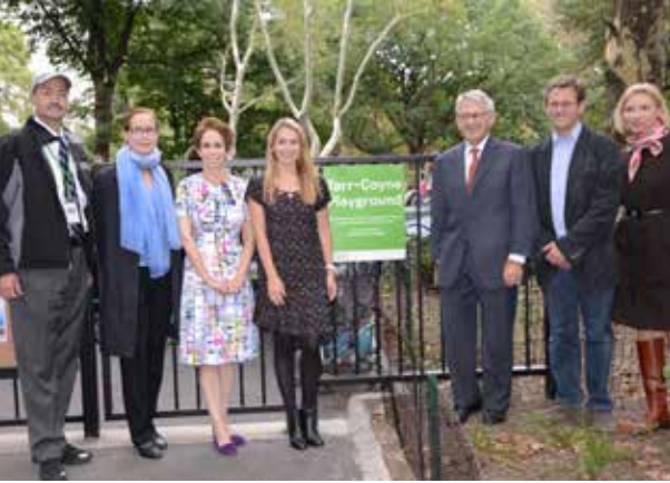
Tarr-Coyne Tots Playground Dedication