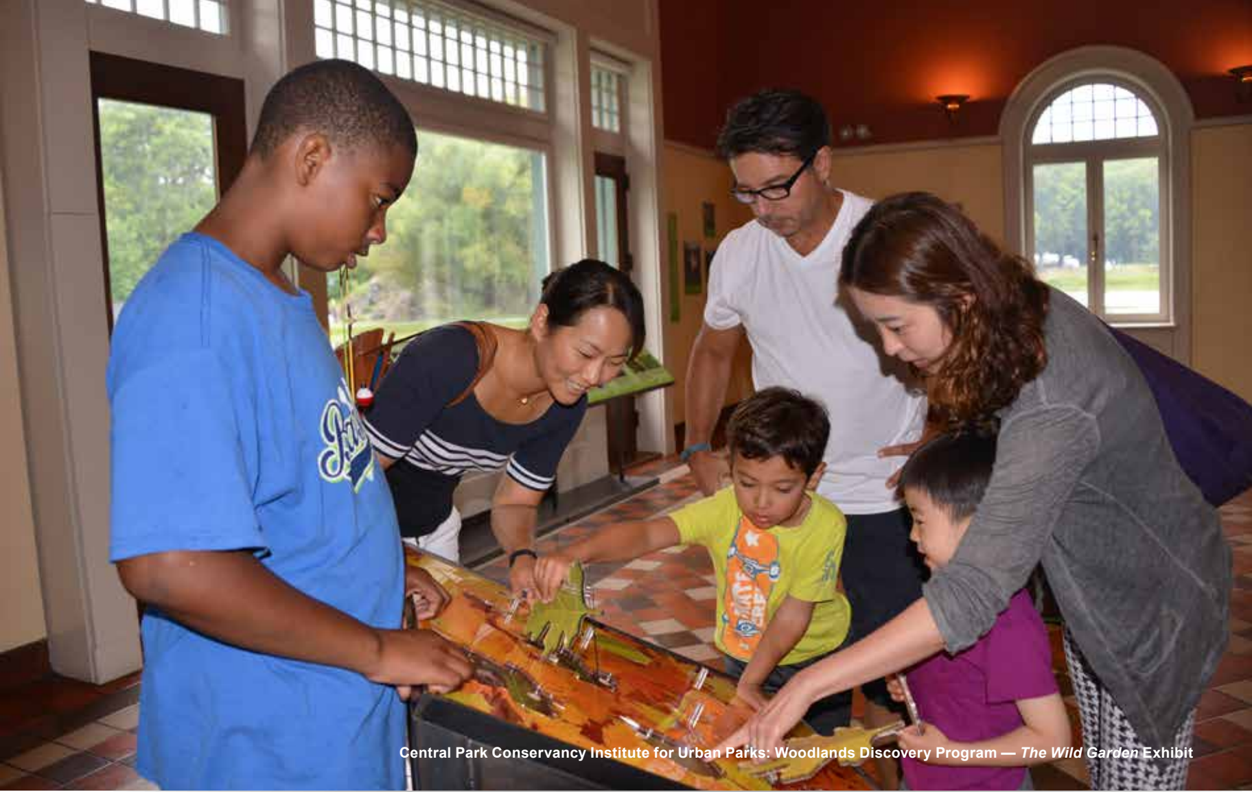
Central Park Conservancy Institute for Urban Parks: Woodlands Discovery Program — The Wild Garden Exhibit