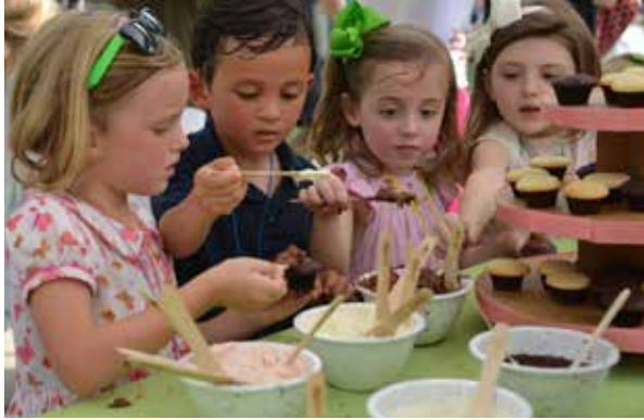
Playground Partners Annual Family Party, sponsored by Brooks Brothers and Goldman Sachs Gives