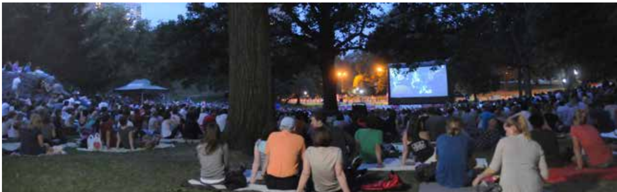
Film Festival, sponsored by Bloomberg