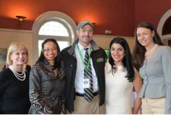
The Central Play Campaign, sponsored by Chase and J.P. Morgan