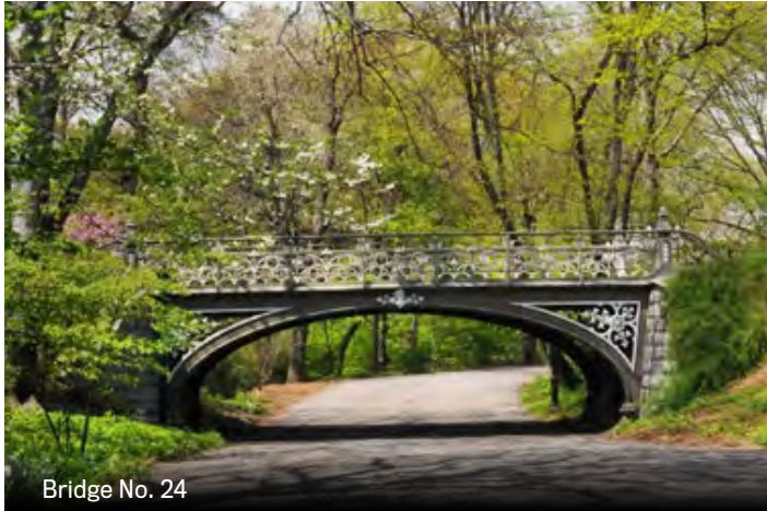
Bridge No. 24