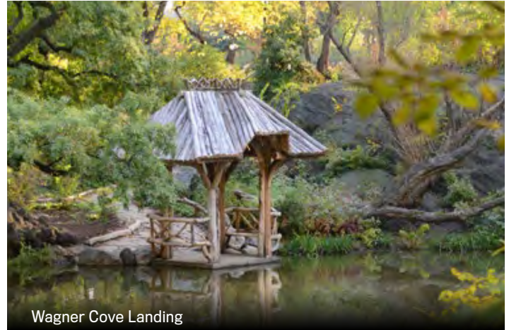
Wagner Cove Landing